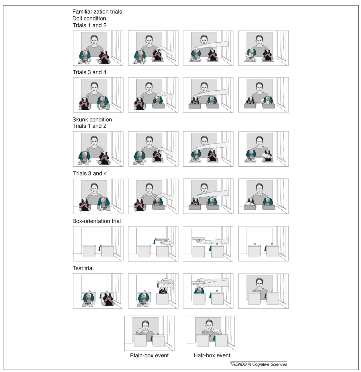
Figure 2. Can 14.5-month-olds attribute to an agent a false perception of an object? In the doll and skunk conditions of Song and Baillargeon [21], the infants first received four familiarization trials. In each trial, a female agent sat behind a doll with blue pigtails and a stuffed skunk with a pink bow. An experimenter's gloved hands placed the toys on placemats in trials 1 and 2 and inside shallow containers in trials 3 and 4. The agent always reached for either the doll (doll condition) or the skunk (skunk condition), suggesting that she preferred it to the other toy. In the box-orientation trial, the agent was absent; two large boxes with lids rested on the apparatus floor and the experimenter rotated each lid in turn, demonstrating that the right box's lid had a tuft of blue hair (similar to the doll's) attached to it. At the start of the test trial, the agent was again absent; the experimenter hid the doll in the plain box and the skunk in the hair box. The agent then returned, reached for either the plain box (plain-box event) or the hair box (hair-box event), and paused.

Finally, building on prior AL results with 3-year-olds [22,23], Southgate et al. [18] showed in a non-verbal AL task that 25-month-olds can correctly anticipate where an agent with a false belief will search for an object. In the familiarization trials, a bear puppet hid a toy in one of two