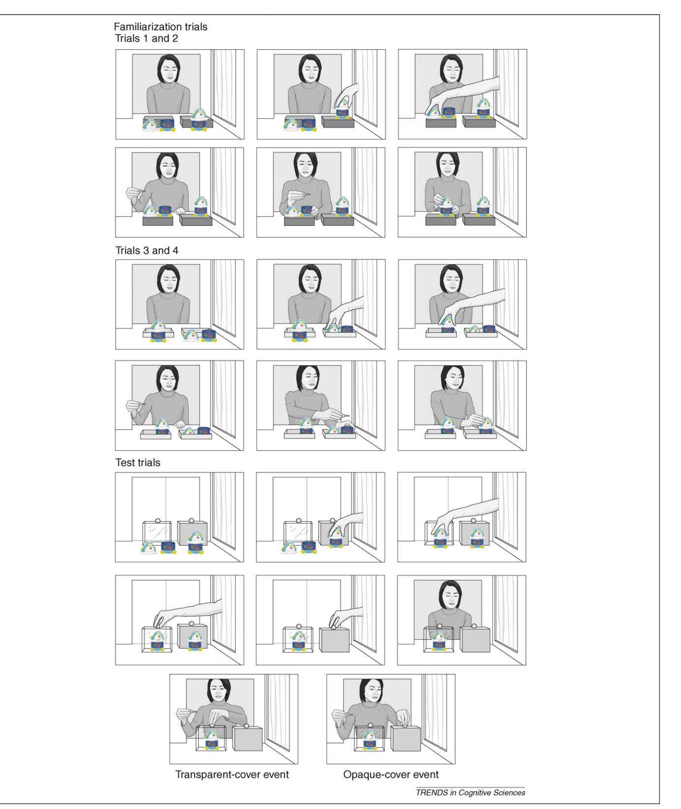
Figure 3. Can 18-month-olds attribute to an agent a false belief about an object's identity? In the false-belief experiment of Scott and Baillargeon [4], the infants received four familiarization trials involving two toy penguins that were identical except that one could come apart (2-piece penguin) and one could not (1-piece penguin). As a female agent watched, an experimenter's gloved hands placed the 1-piece penguin and the two pieces of the disassembled 2-piece penguin on platforms in trials 1 and 2 and in shallow containers in trials 3 and 4. The agent then placed a key in the bottom piece of the 2-piece penguin, stacked the two pieces, and paused. During the test trials, while the agent was absent, the experimenter assembled the 2-piece penguin, covered it with a transparent cover, and then covered the 1-piece penguin with an opaque cover. The agent then entered the apparatus with her key, reached for either the transparent cover (transparent-cover event) or the opaque cover (opaque-cover event), and paused. Order of presentation of the two test events was counterbalanced.