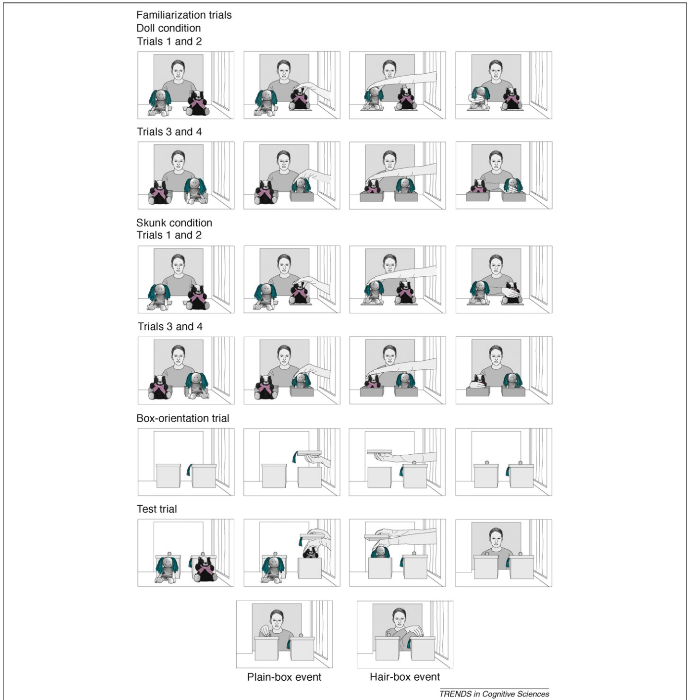
Figure 2. Can 14.5-month-olds attribute to an agent a false perception of an object? In the doll and skunk conditions of Song and Baillargeon [21], the infants first received four familiarization trials. In each trial, a female agent sat behind a doll with blue pigtailed and a stuffed skunk with a pink bow. An experimenter’s gloved hands placed the toys on placemats in trials 1 and 2 and inside shallow containers in trials 3 and 4. The agent always reached for either the doll (doll condition) or the skunk (skunk condition), suggesting that she preferred it to the other toy. In the box-orientation trial, the agent was absent; two large boxes with lids rested on the apparatus floor and the experimenter rotated each lid in turn, demonstrating that the right box’s lid had a tuft of blue hair (similar to the doll’s) attached to it. At the start of the test trial, the agent was again absent; the experimenter hid the doll in the plain box and the skunk in the hair box. The agent then returned, reached for either the plain box (plain-box event) or the hair box (hair-box event), and paused.

Finally, building on prior AL results with 3-year-olds [22,23], Southgate et al. [18] showed in a non-verbal AL task that 25-month-olds can correctly anticipate where an agent with a false belief will search for an object. In the familiarization trials, a bear puppet hid a toy in one of two