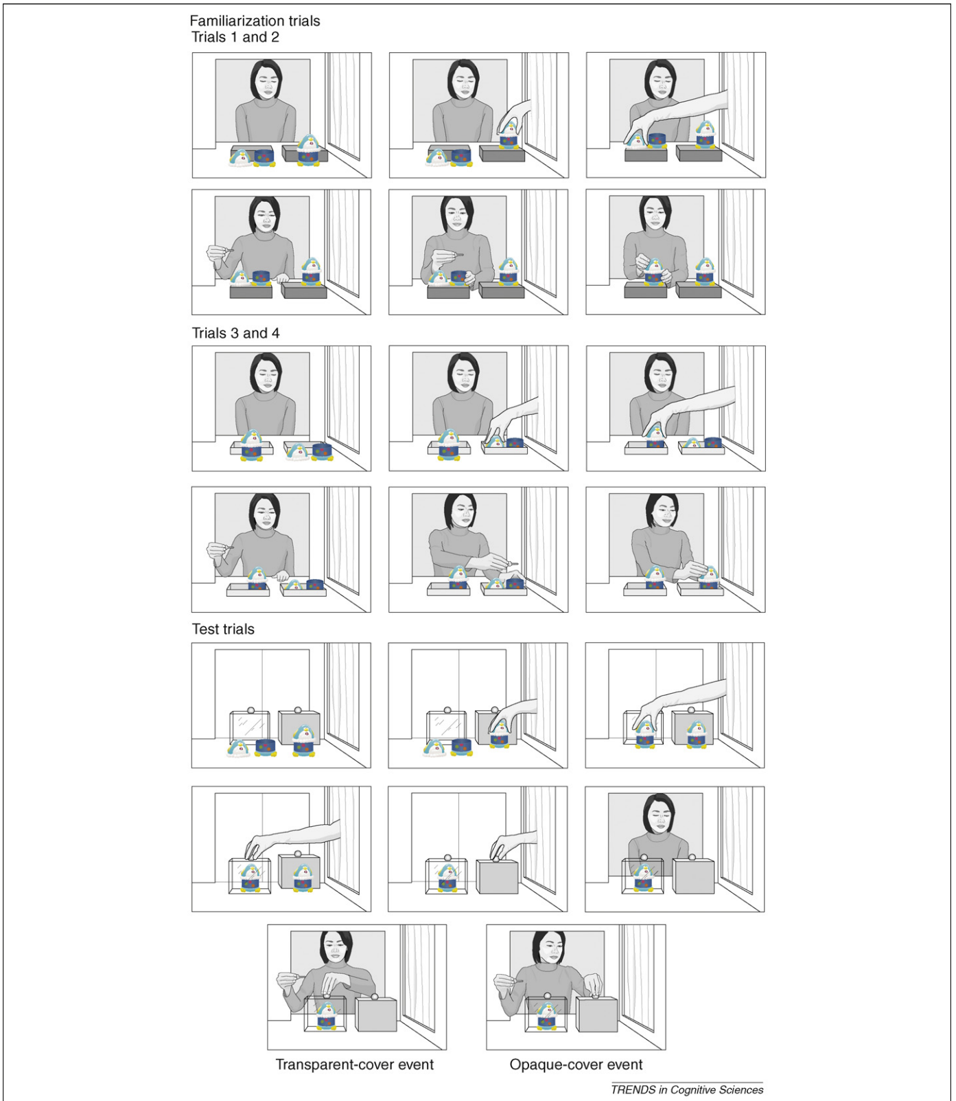
Figure 3. Can 18-month-olds attribute to an agent a false belief about an object's identity? In the false-belief experiment of Scott and Baillargeon [4], the infants received four familiarization trials involving two toy penguins that were identical except that one could come apart (2-piece penguin) and one could not (1-piece penguin). As a female agent watched, an experimenter's gloved hands placed the 1-piece penguin and the two pieces of the disassembled 2-piece penguin on platforms in trials 1 and 2 and in shallow containers in trials 3 and 4. The agent then placed a key in the bottom piece of the 2-piece penguin, stacked the two pieces, and paused. During the test trials, while the agent was absent, the experimenter assembled the 2-piece penguin, covered it with a transparent cover, and then covered the 1-piece penguin with an opaque cover. The agent then entered the apparatus with her key, reached for either the transparent cover (transparent-cover event) or the opaque cover (opaque-cover event), and paused. Order of presentation of the two test events was counterbalanced.